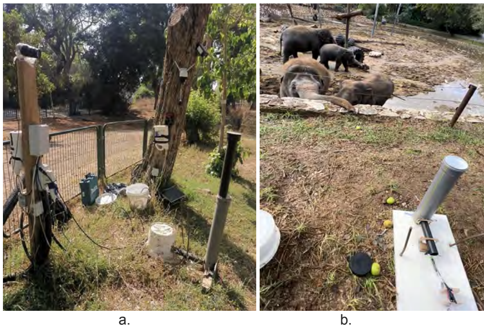
Figure 2. EleProje – Elephant monitoring system. Figure 2a. System components deployment. Figure 2b. Mechanical fruit reward sub-system.

Finally, a third improvement referred to a more uniform academic quality of the projects. This is mainly due to the strict milestone schedule, which forced both students and their s to synchronize and submit the respective standardized documentation, as illustrated in Figure 1. In this way, the inherent variation between AG approaches is eased slightly.